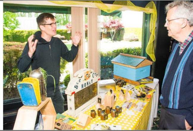
2. Hives for Humanity display