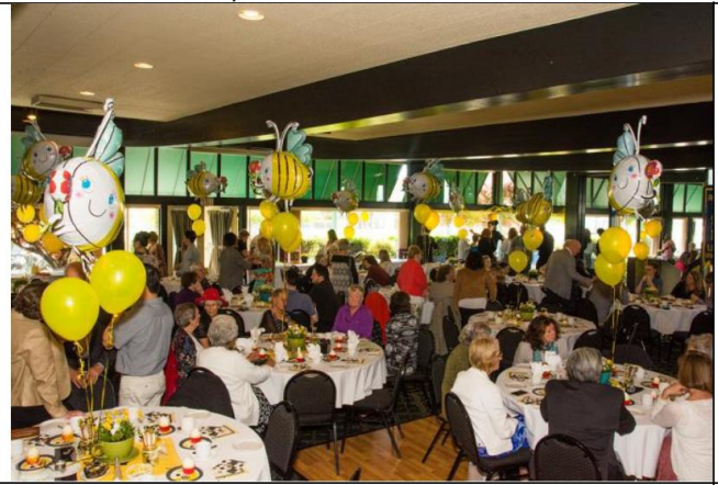
1. 100 people attended the Queen Bee Tea on Mother's Day