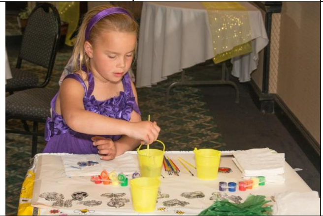
3. Family members of all ages participated